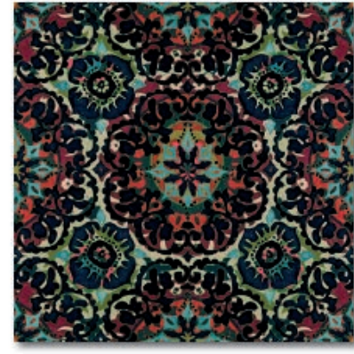
MADRID PDE2020C13 28i P