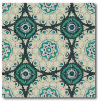
CASABLANCA PDE2020C05 28i P