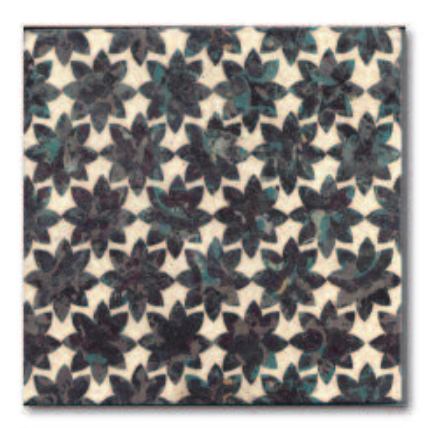
PORTOFINO PDE2020C18 28i P