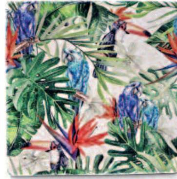
PDE2020C24 28i P

Don't forget: Printing on 5x5 formats, see page 247