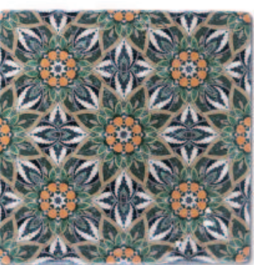
NYONS PDE2020C26 28i P