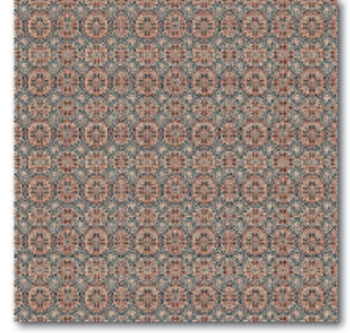
PDE2020C04 28i P