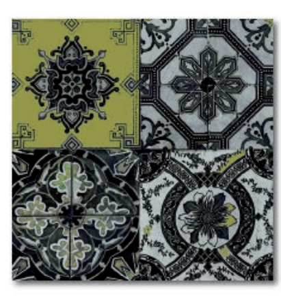
LIMASSOL PDE2020C11 28i P