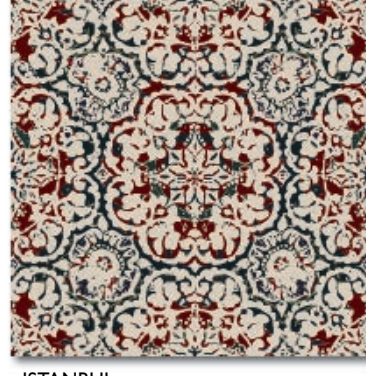
PDE2020C02 28 i P