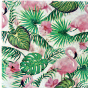
NAKURU PDE2020C22 28i P

Decorated stone will add nobility as well as a modern touch to your precious interior. The innovative printing technique on a material such as stone guarantees a product of the highest quality. The designs adapt to any kind of architecture, from the most classical to the boldest one.