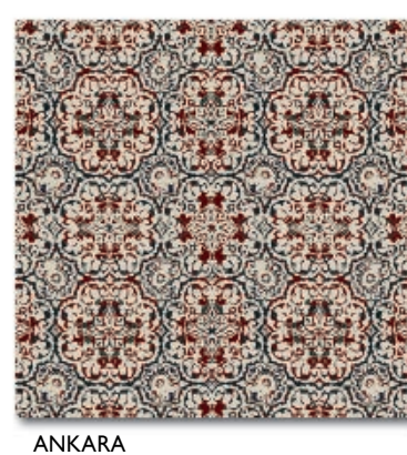
PDE2020C03 28 i P