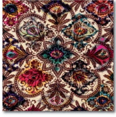
LAHORE PDE2020C14 28 i P