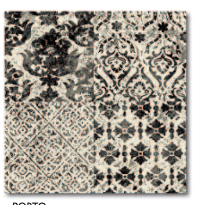
PDE2020C19 28i P