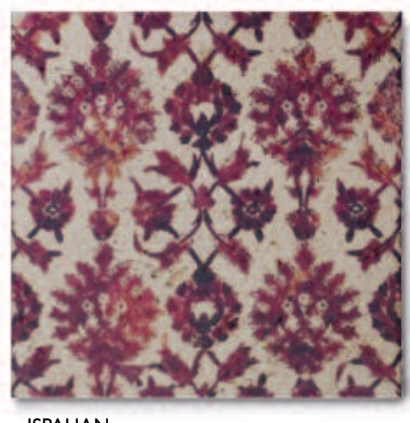
ISPAHAN PDE2020C21 28 i P