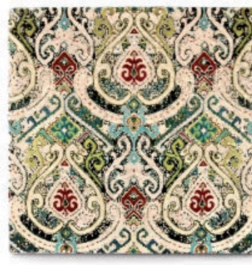
JAIPUR PDE2020C08 28i P