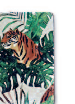
CALCUTTA PDE2020C23 28i P