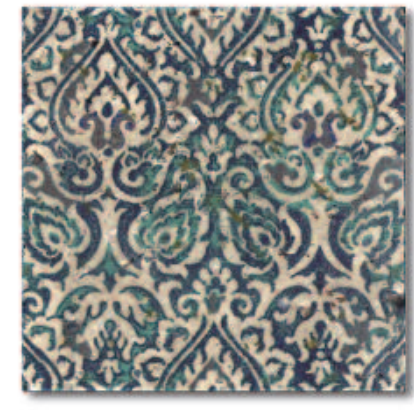
PONDICHERY PDE2020C17 28i P