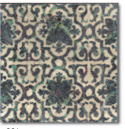
PDE2020C20 28i P