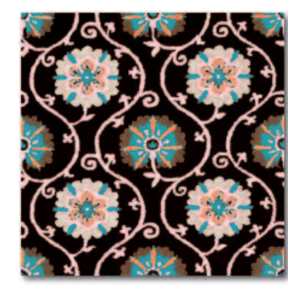
ORAN PDE2020C15 28 i P